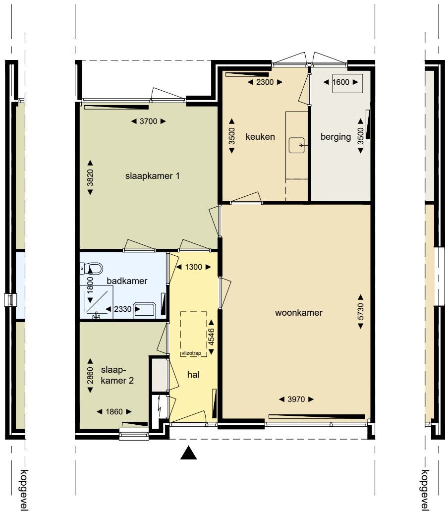
Begane grond schaal 1:100